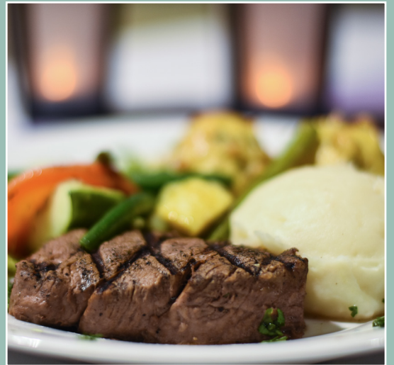
Left to right, clockwise: Kimberly Lyddane Photography, Nicole Babcock Photography, Turf Valley Resort, and Jessica Eastburn Photography