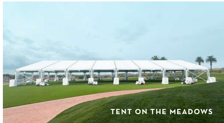
TENT ON THE MEADOWS