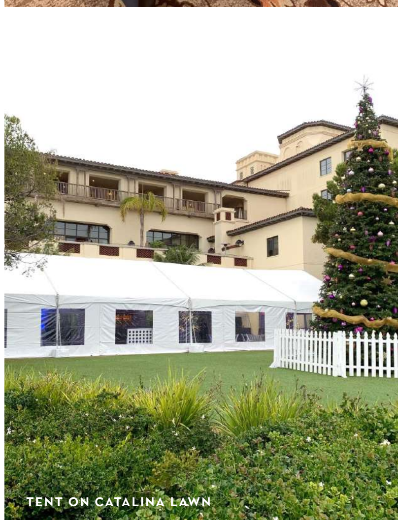
TENT ON CATALINA LAWN