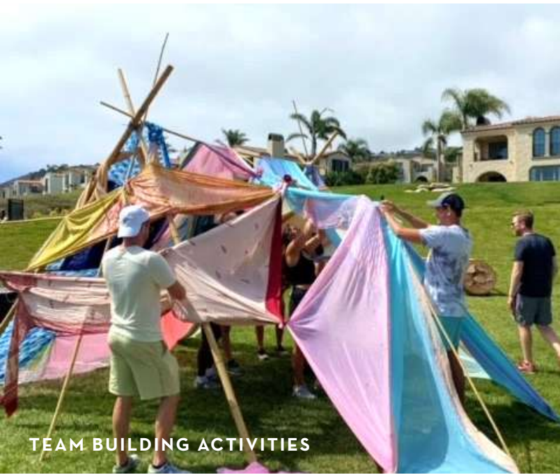
TEAM BUILDING ACTIVITIES