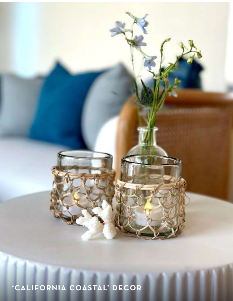
'CALIFORNIA COASTAL' DECOR