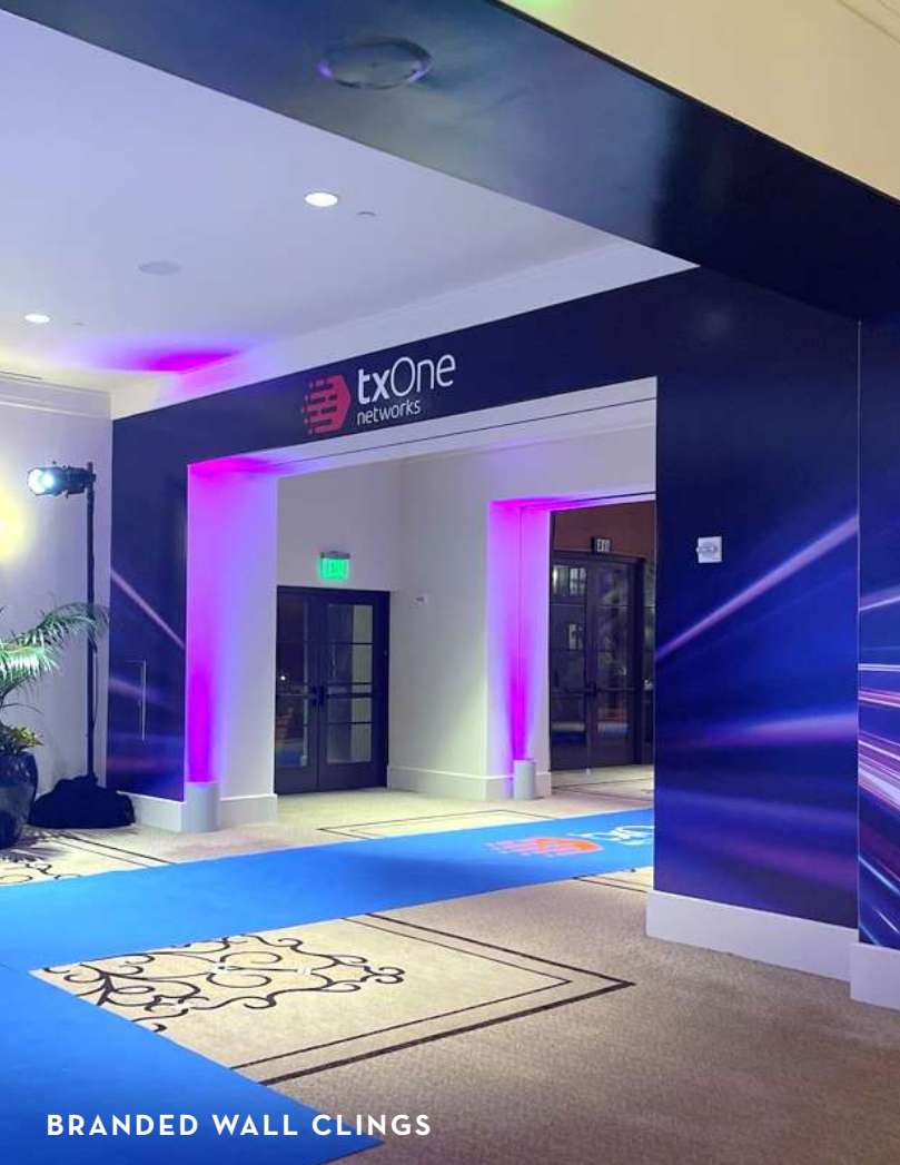
BRANDED WALL CLINGS