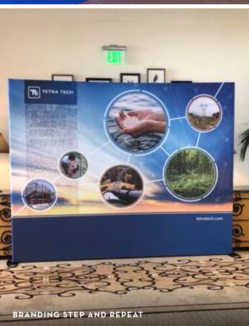
BRANDING STEP AND REPEAT