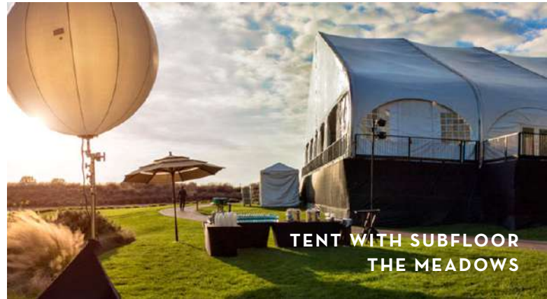
TENT WITH SUBFLOOR THE MEADOWS