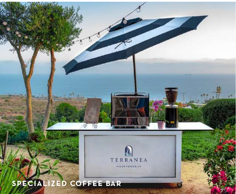
SPECIALIZED COFFEE BAR