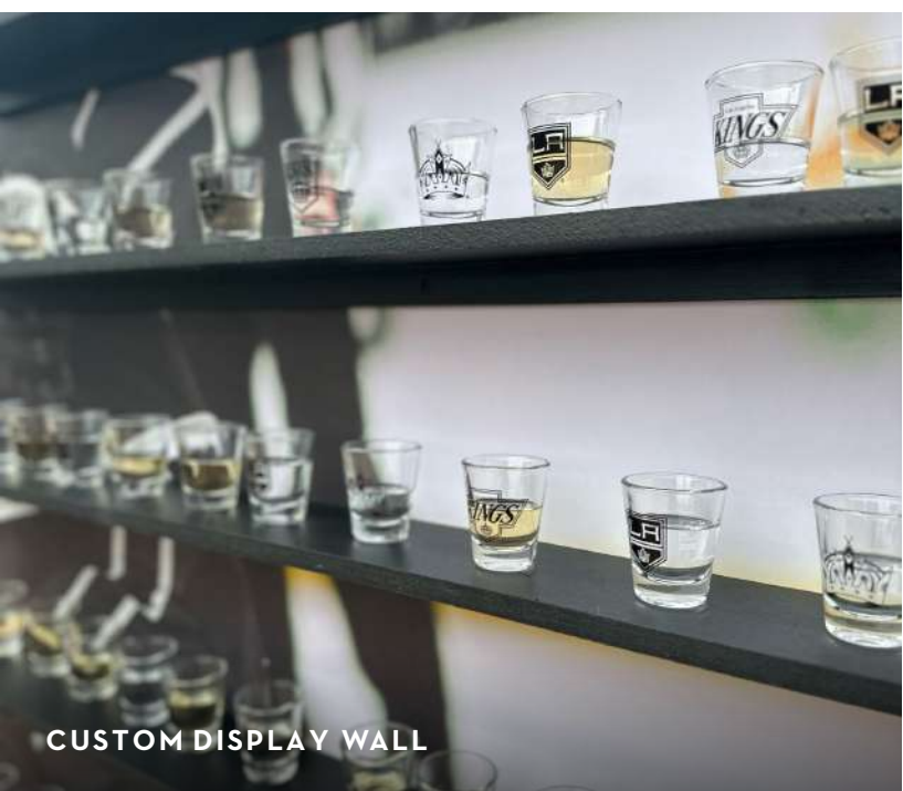
CUSTOM DISPLAY WALL