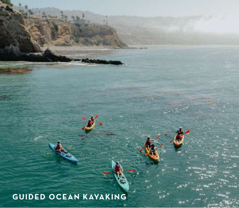
GUIDED OCEAN KAYAKING