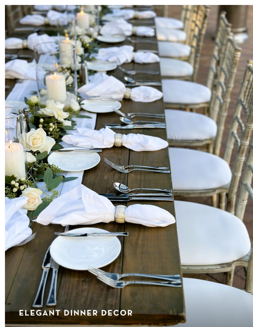
ELEGANT DINNER DECOR