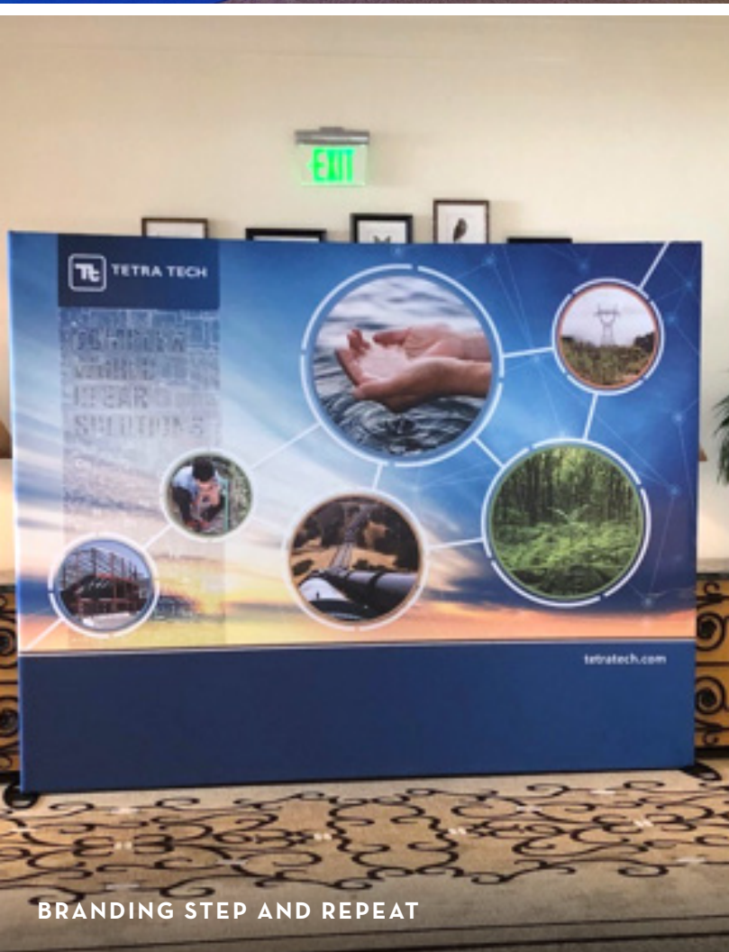
BRANDING STEPAND REPEAT