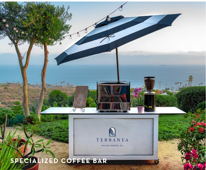
SPECIALIZED COFFEE BAR