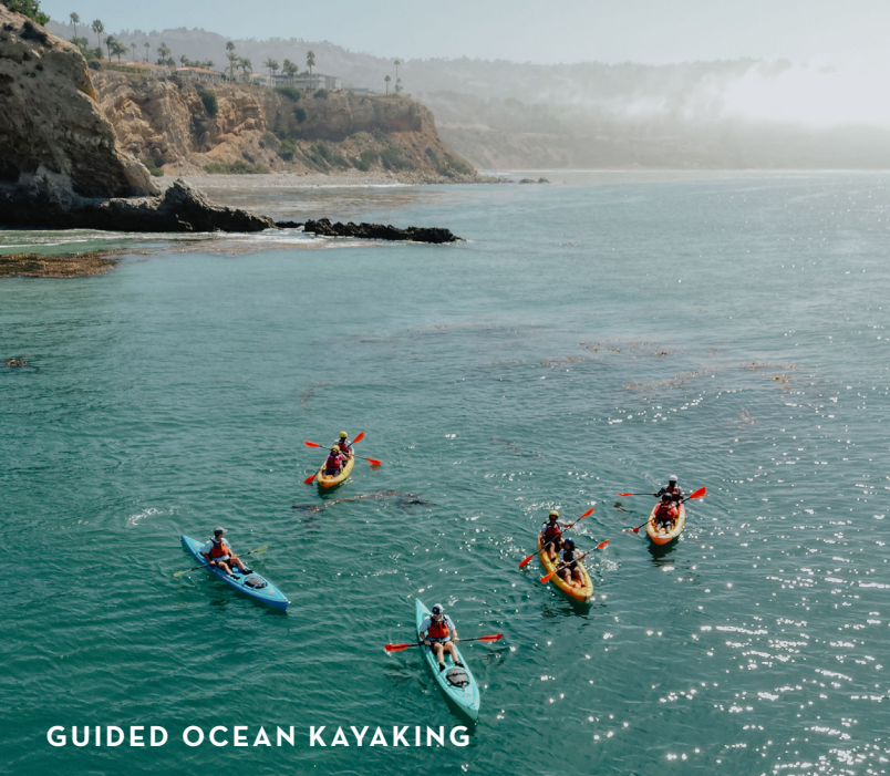
GUIDED OCEAN KAYAKING