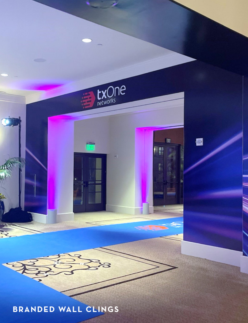
BRANDED WALL CLINGS