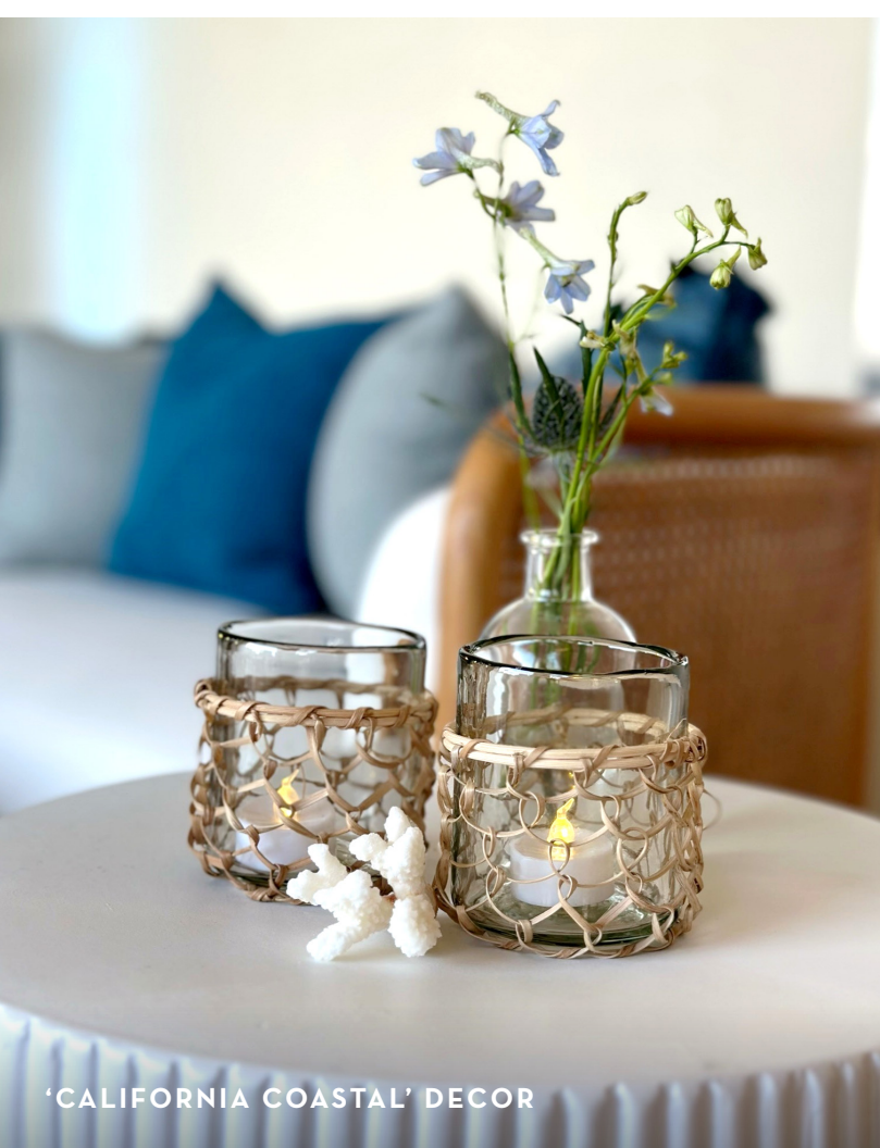
'CALIFORNIA COASTAL' DECOR