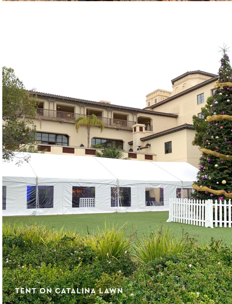
TENT ON CATALINA LAWN