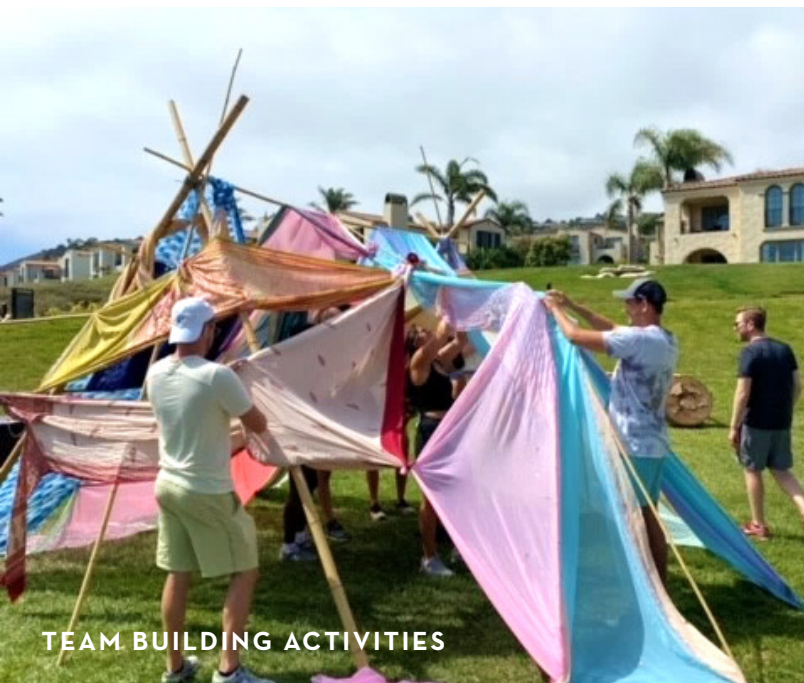
TEAM BUILDING ACTIVITIES