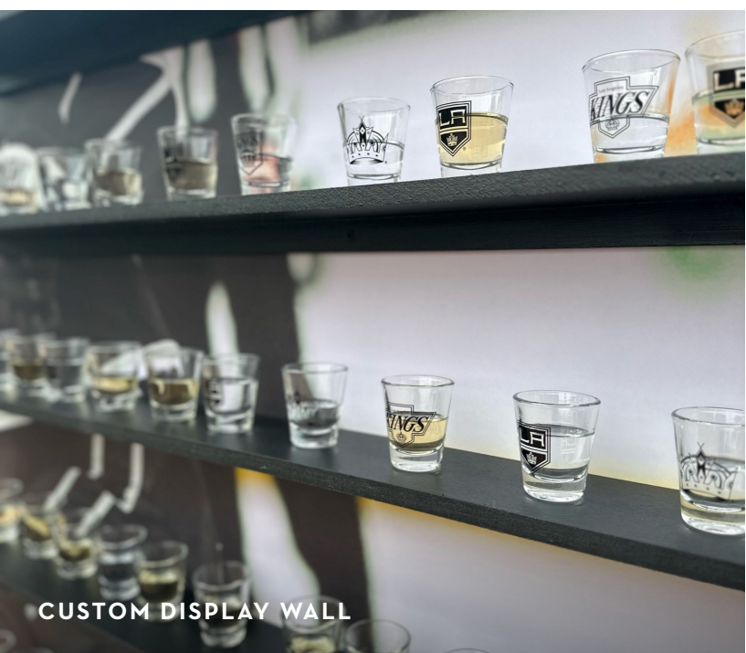
CUSTOM DISPLAY WALL