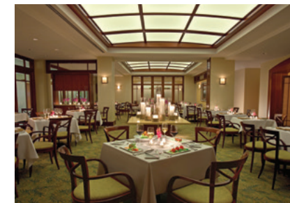
Aura Dining Room