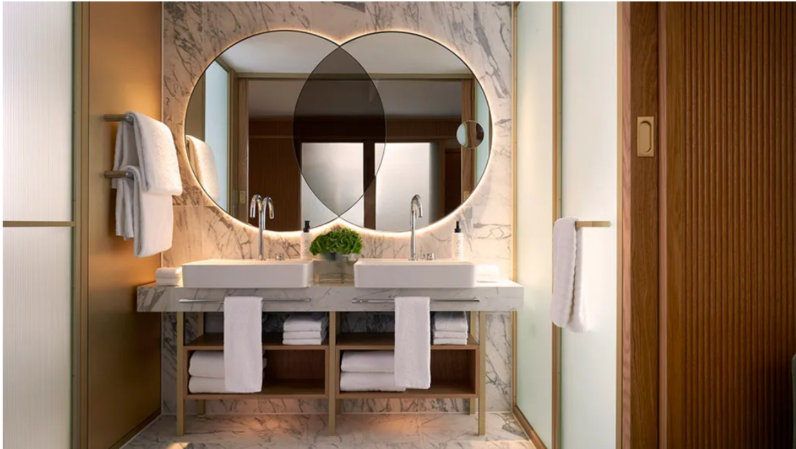
A double vanity means plenty of sink space. The BoTree

the hotel’s founder, told Robb Report in an email. “It will create a sense of belonging at the BoTree, which I can’t wait for everyone to experience.”