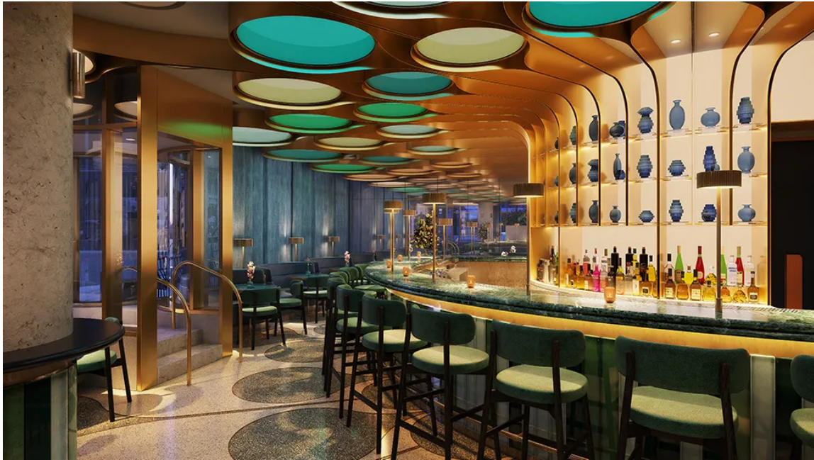
The swank BoTree Bar The BoTree