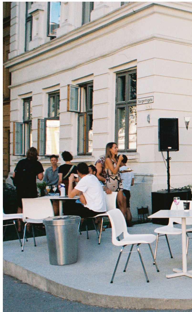
FROM TOP: Fish soup at Festningen; the dining room at Amerikalinjen, a hotel in the namesake shipping line's onetime headquarters. ABOVE RIGHT: The outdoor terrace of Sorgenfri.

was reported to be the winning bidder on the fourth at Sotheby's for nearly $120 million in 2012.