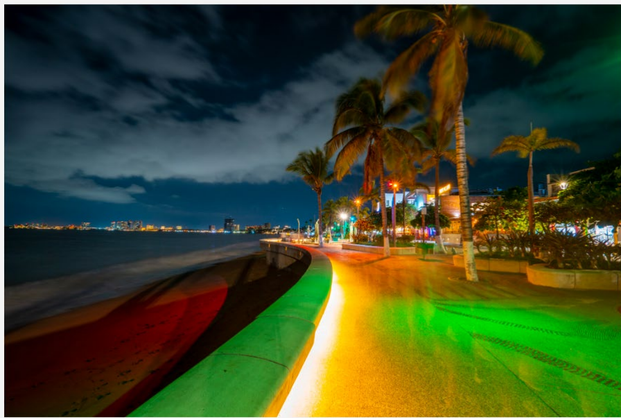
Puerto Vallarta has a vibrant entertainment scene with nightly happenings year-round.

Stroll the Malecon , Puerto Vallarta's fabled Boardwalk. Navigate more than 12 blocks of prime esplanade traversing Puerto Vallarta's El Centro and Zona Romantica for some of the city's best people watching, street vendors, ocean views, and cultural flavor. The Malecon is buzzing night or day and features some of Puerto Vallarta's most notable landmarks such as El Caballito (the boy on the seahorse) sculpture by Rafael Zamarripa. The sculpture fronts the Letras Puerto Vallarta , the most photographed landmark in the city.