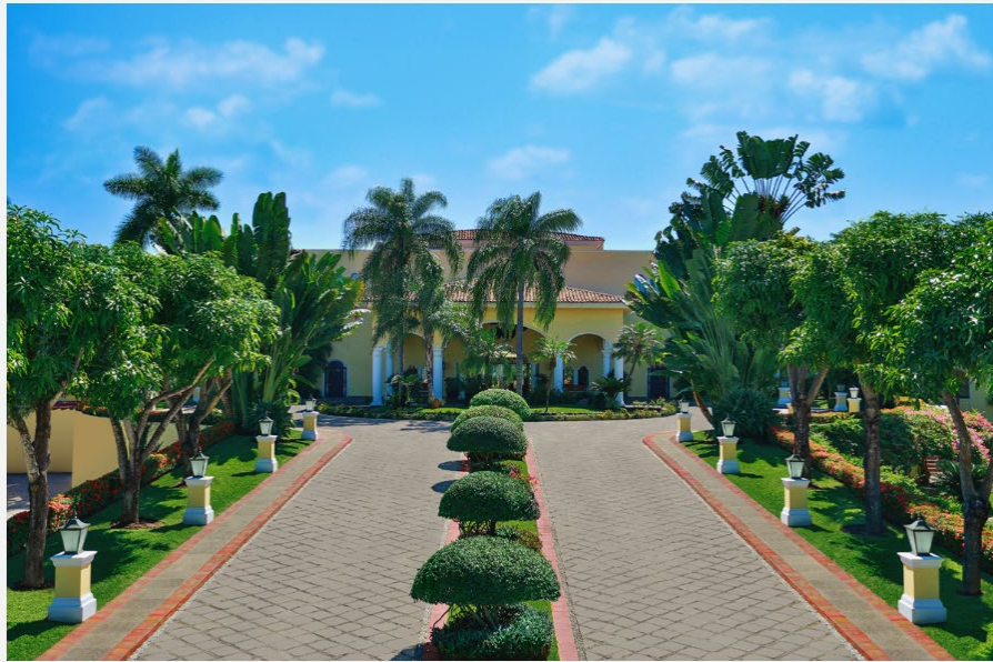
Casa Velas is an intimate boutique adults-only resort and spa in Puerto Vallarta's waterfront Marina District.

Casa Velas. This boutique adults-only all-inclusive property is an oasis of serenity that delivers high touch service and plush amenities for guests serious about enjoying sun-soaked comfort. Visitors find 80 rooms, many with their own outdoor plunge pools or Jacuzzis, surrounded by finely manicured gardens, an oversized pool with private cabanas, and plenty of shady outdoor hideaways for quiet contemplation or simply catching up on the latest beach read.