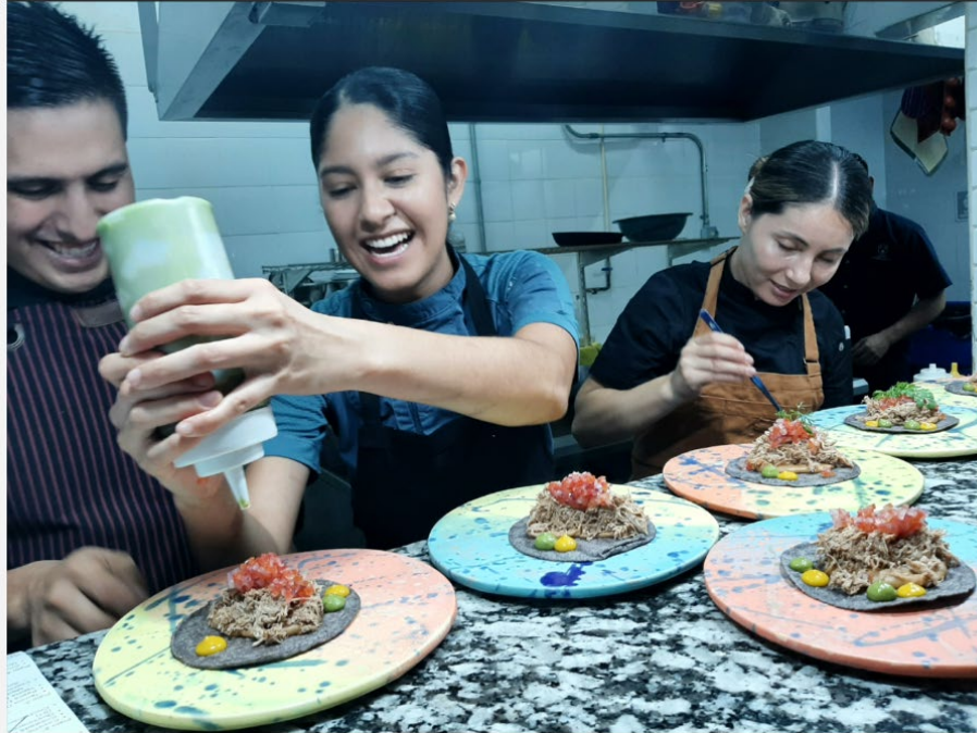
Makal is part of the burgeoning culinary scene that is putting fresh twists on traditional Mexican fare.

Makal. Wickedly creative cocktails like the Quetzal (Mexican gin, cucumber, coconut water, basil, and celery bitters) tip off diners early on they're in for a special treat. Regional Mexican specialties like Molotes – stuffed plantains in a poblano mole and a stellar Oxtail Terrine with adobo and parsnip puree show off the serious kitchen chop at Makal and deliver an evening out that simply rocks.