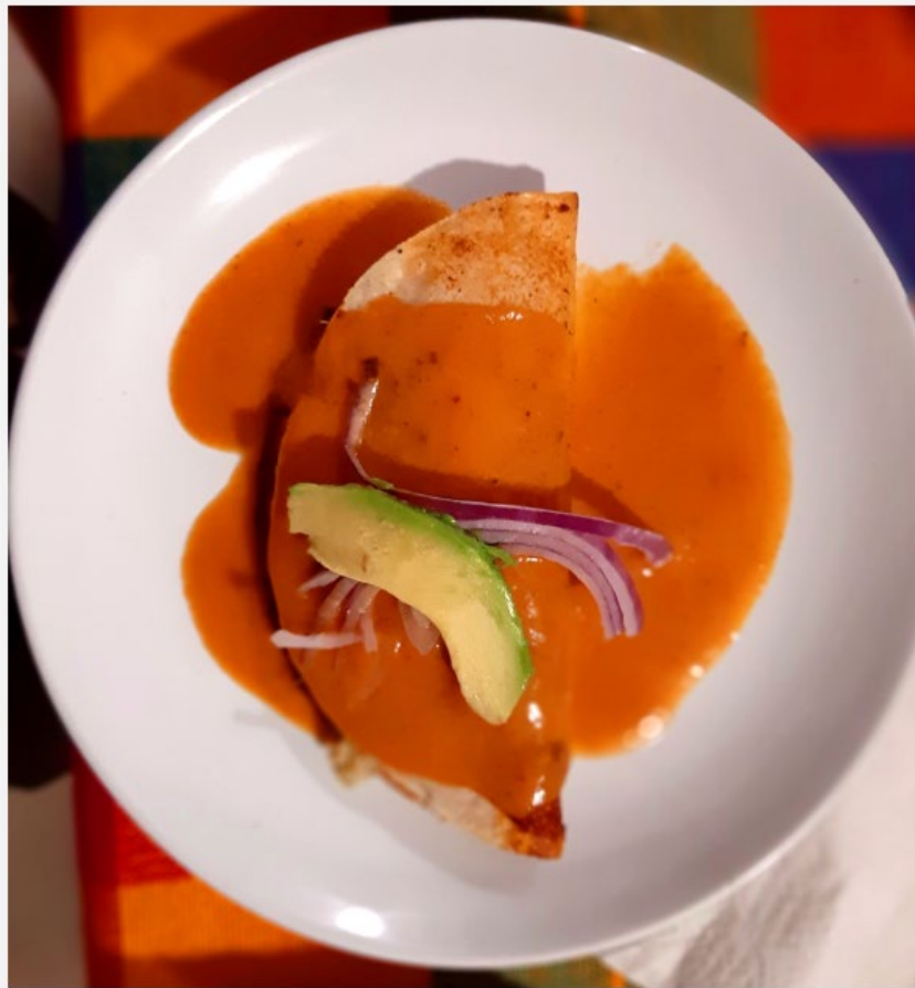
Tacos tell a wonderful cultural story and are ubiquitous in Puerto Vallarta.

Tinquote. Named one of the 120 best restaurants in Mexico by Culinaria Mexicana, this bastion to innovative contemporary Mexican cuisine delights with their 8-10 course tasting menu and culinary tour. Technique, top ingredients, and passion infused dishes such as the 36 hour tomato stuffed with goat cheese and crab tartlet with herbal haydari and peanut adobe, leave diners delighted and anxious to return.