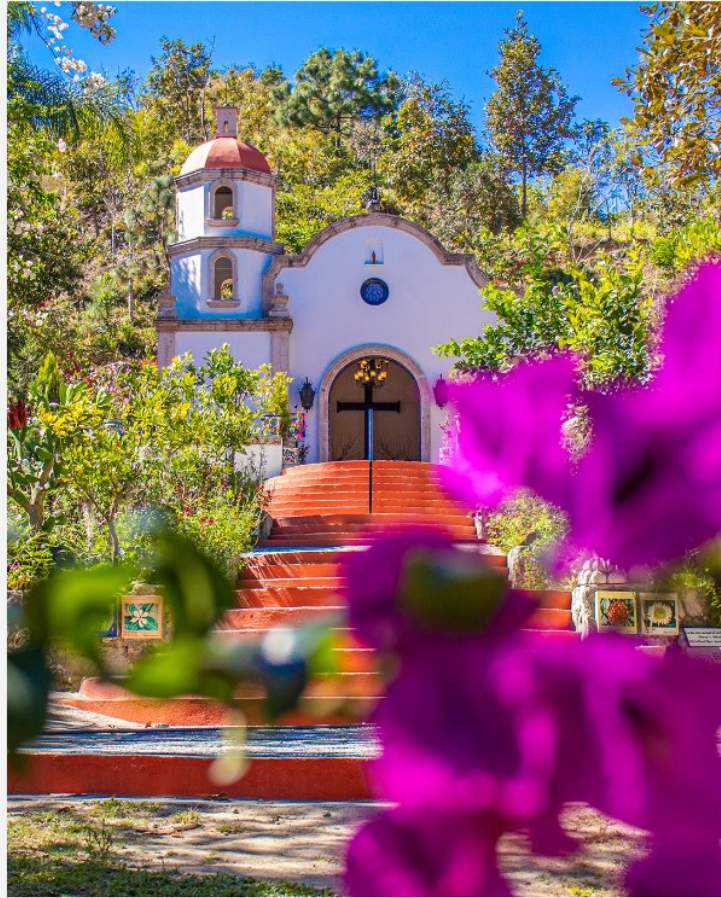
Vallarta Botanical Garden offers visitors hiking trails, river access, guided vanilla plantation tours and stunning orchid collection.

https://luxebatmag.com/sunny-side-up-puerto-vallarta-glows-as-mexicos-sparkling-west-coast-gem/