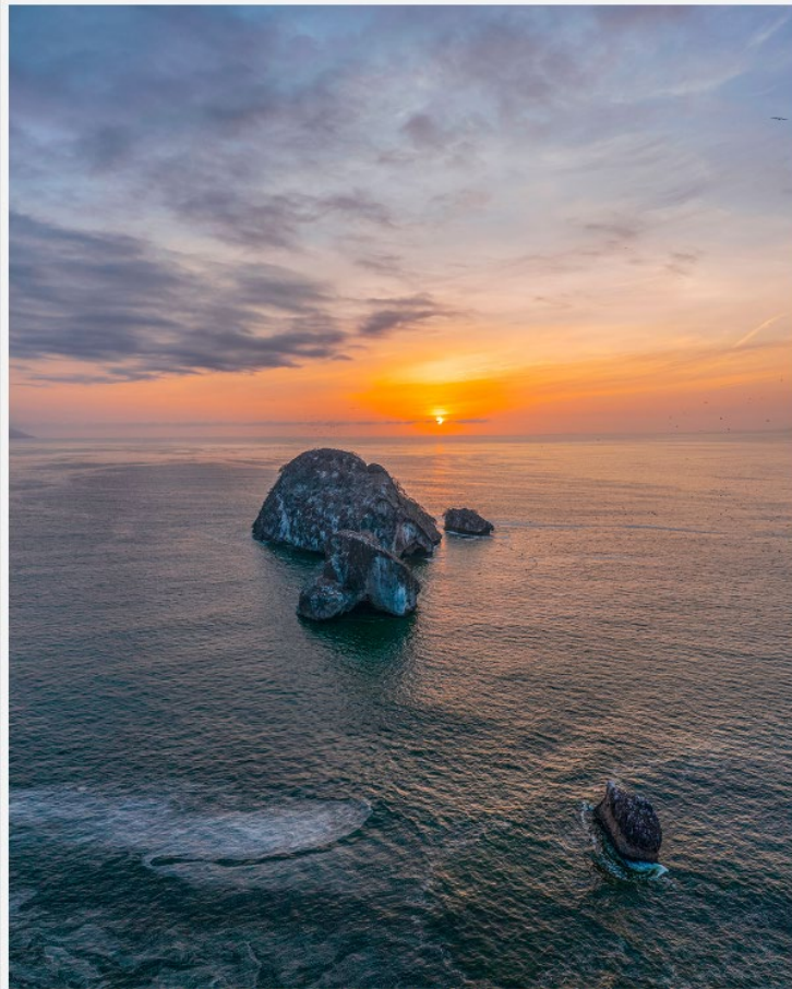
Los Arcos de Mismaloya is a breathtaking rock formation off the shores of Puerto Vallarta.

Get out on the open water with a day tour of Banderas Bay . Captain Dave at Ol Salty's Ranch is the skipper you want to navigate your crew out on the Bay as you head for Los Arcos (the arches) de Mismaloya, a natural rock formation 30 minutes out from Los Muertos Beach Pier. Here snorkeling, sight-seeing and kicking back is the order of the day where sparkly marine life give visitors a sideshow and welcome to remember. Arrange for an in-water guide like Tatiana at Mexico Real Tours who's certain to safely steer your group to the best sites for spying the underwater sea life. She'll be sure to take you to Playa Colomitos , the tiniest and most Instagram worthy beach in all of Mexico.