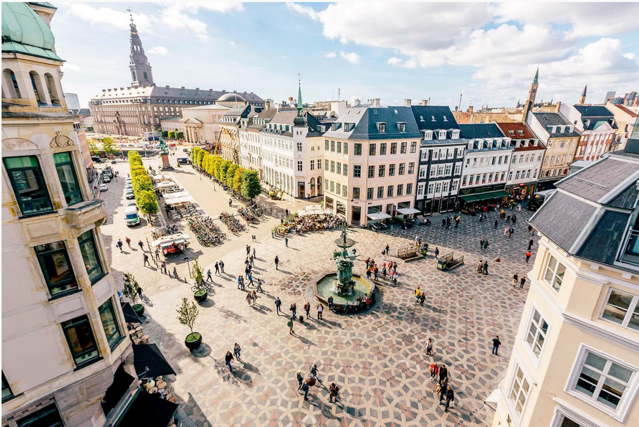
Stroget in Copenhagen

to see powerful clouds, feel colder winds, take a dip in ice-cold glacier water or even have an excuse to buy a new down feather jacket.”