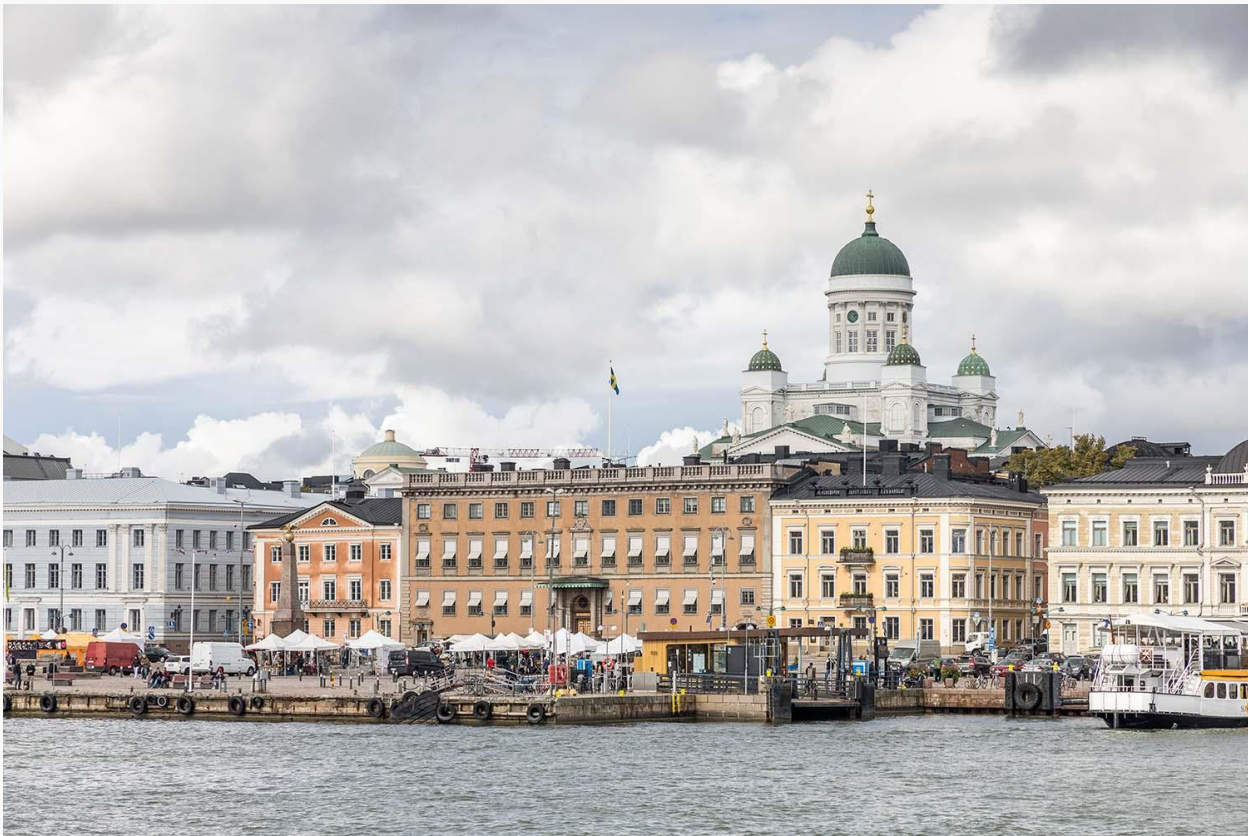
Helsinki Market Square

A classic Copenhagen experience, Tivoli Gardens first opened in 1843 and is the world's second-oldest amusement park. It's where Walt Disney found inspiration for Disney World, and today entertains the young and young at heart with rides, theaters, a concert hall, a food hall, and lots of on-site bars and restaurants.