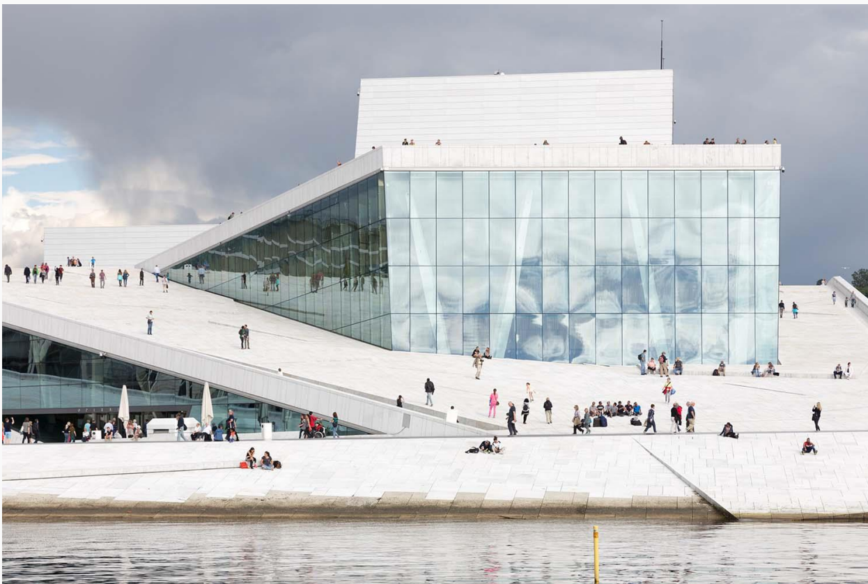
The Oslo Opera House

Whether you choose to visit the larger cities like Helsinki and Oslo or escape to smaller seaside towns and Arctic Circle locales, adventure awaits those looking for cooler weather out of a summertime vacation in Scandinavia. Below, a few recommendations on places to dine, stay and frolic in Scandinavia: