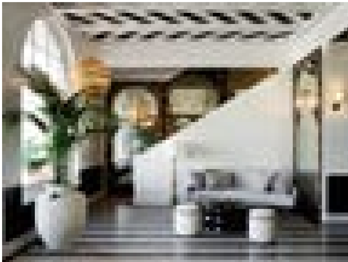
Hotel Californian's Moorish interiors are unexpected and modern.