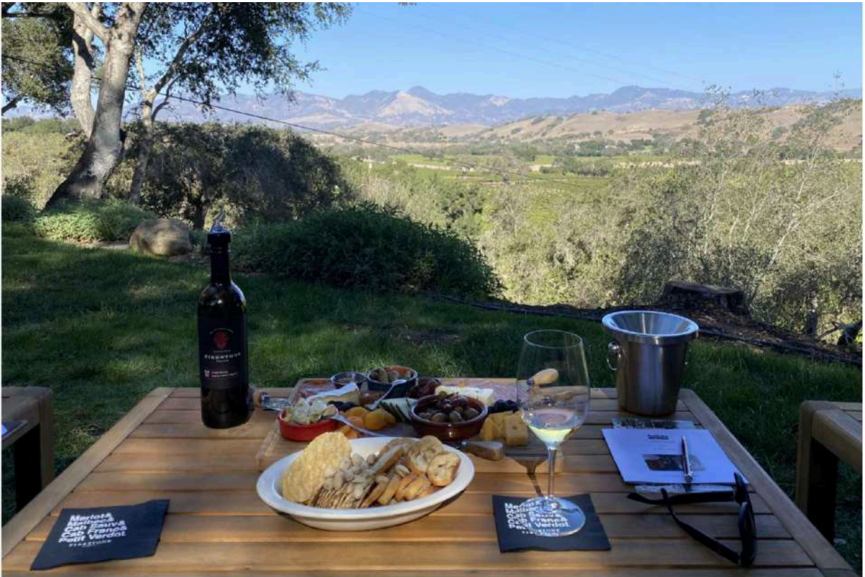
Firestone Winery, a filming location for "Sideways."

reality TV stars, tire legends, or Hollywood actors, but you can savor an exceptional fumé blanc while soaking up hilltop views.