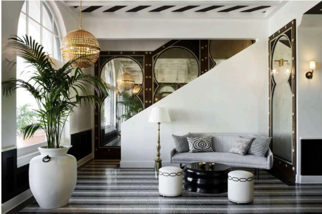
Moroccan-inspired interiors and tiles galore at Hotel Californian.

SANTA BARBARA, California - Ask a wine drinker — anyone from a seasonal rosé sipper to a full-fledged oenophile — about California wine destinations, and they'll likely point you to the northern part of the state. For good reason, because Napa and Sonoma are the stars of the Golden State's wine world. But we shouldn't overlook the wine wonderland south of San Francisco.