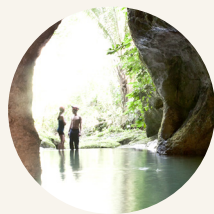
VISIT SACRED CAVES