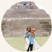
EXPLORE MAYA RUINS