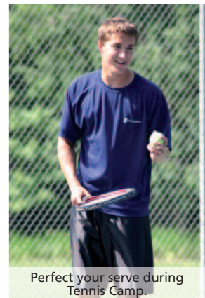
Perfect your serve during Tennis Camp.