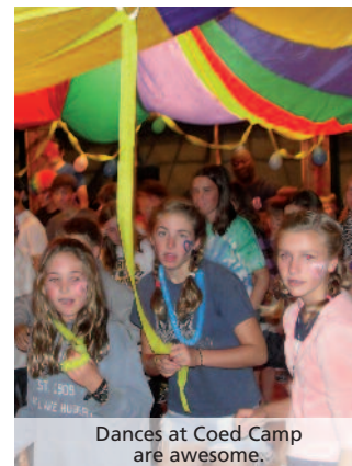
Dances at Coed Camp are awesome.

For more information or to register, log on to our website today, lincoln-lakehubert.com