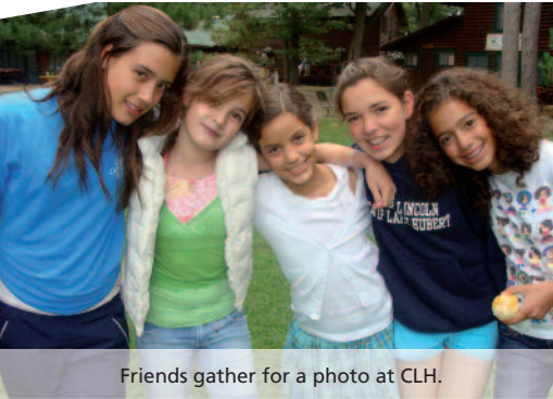
Friends gather for a photo at CLH.