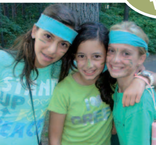
Green Team Members take a time out during challenges for a photo.