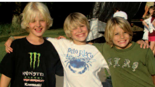
Spending time with friends is great on Special Days.