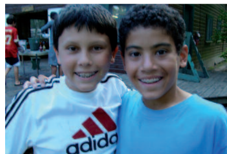
Stay connected with camp friends all year long on The Virtual Campfire.