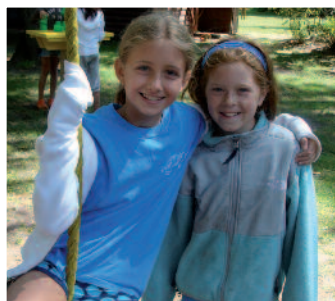
Its always fun swinging on the tree swings at CLH.