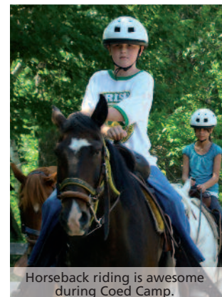
Horseback riding is awesome during Coed Camp.