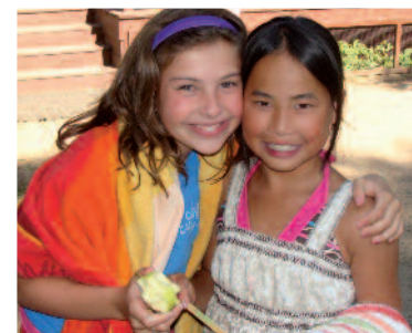
Snack time with friends is great.