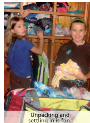
Unpacking and settling in is fun.