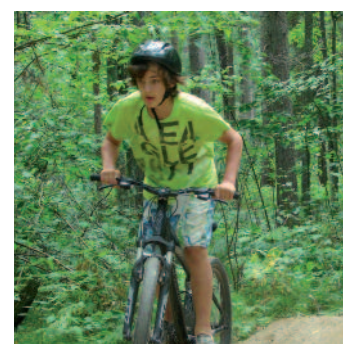
The Pump Track at Camp Lincoln is fun and challenging.