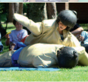
Carnival Day at Camp Lincoln is awesome!