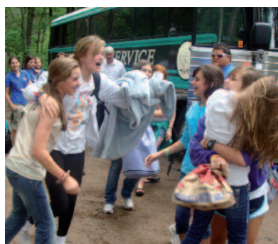
Seeing your friends after a whole school year is the best!