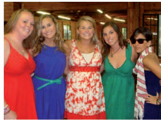
Do not forget your dress up clothes for Banquet Night.