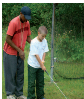
You will receive a lot of one-on-one coaching during Golf Camp.

Join us for Golf Camp this summer! To ensure that you get the session of your choice, make sure to register today!