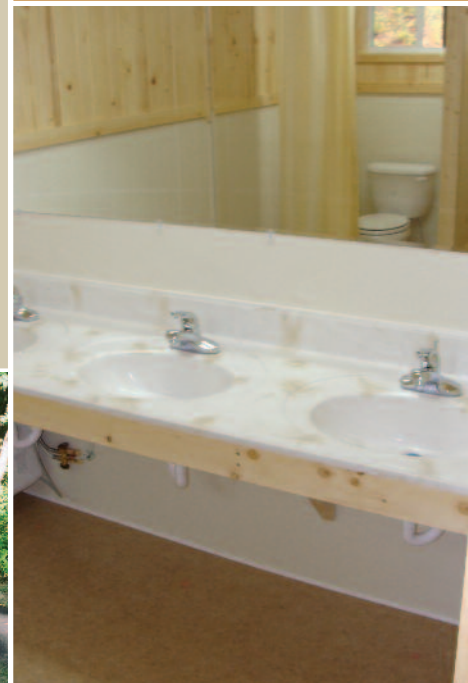
Upstairs & Downstairs bathrooms in Happy Hollow updated.