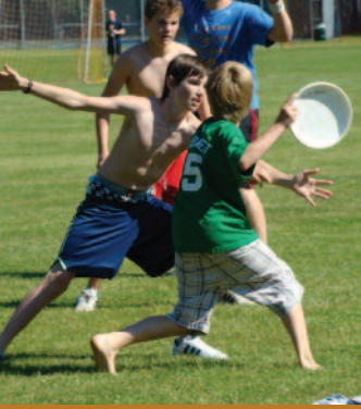
Ultimate frisbee is fast.