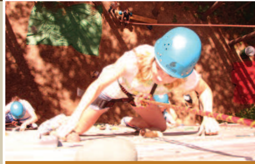
Can you believe how high we are?