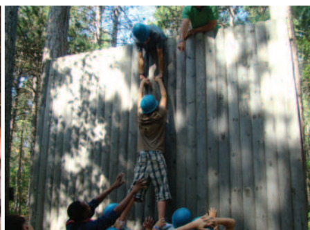
The low ropes wall is harder than you think.