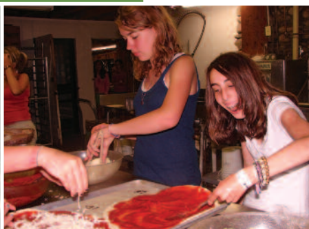
Making pizza is fun.