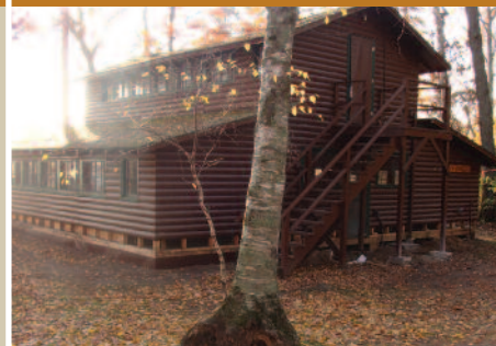
Rangers cabin construction for new updated bathroom.