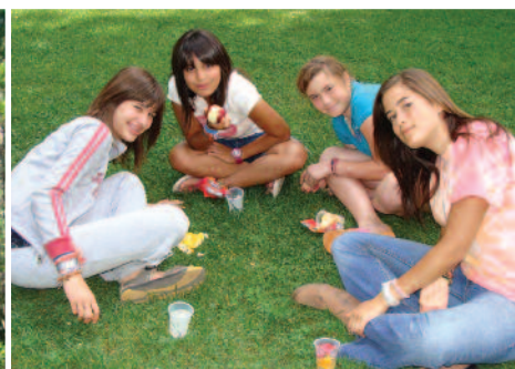
Snack time is a great time to share.