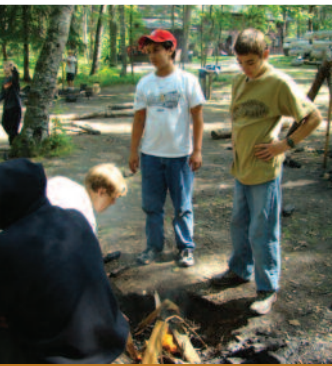
I can actually start a fire.