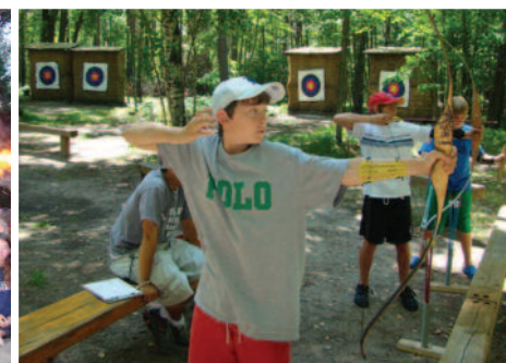
I got a bulls eye!