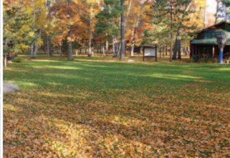
The center area of camp has been leveled and grass seeded.