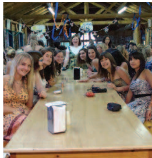
Another Banquet celebration.