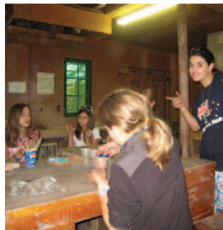
Pottery is the best.