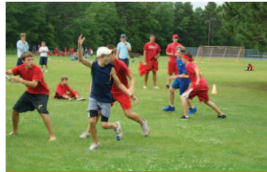
Color War's competition.

Check out the website www.lincoln-lakehubert.com for the latest dates and locations. There are a few locations this fall but watch late January and February for even more showings. Join us when we come your way to see our best version of the 2008 season in action.