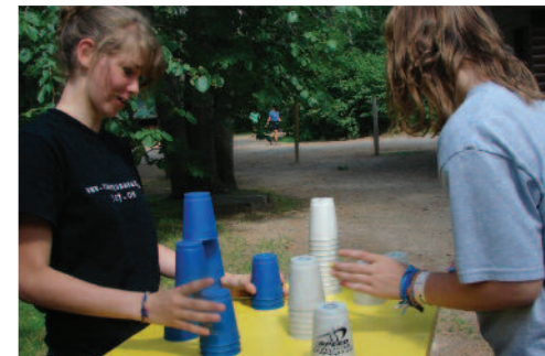
Stacking cups are fun.