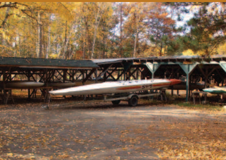
New E boat arrives at camp.