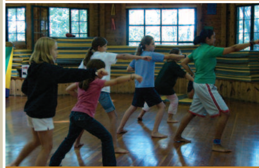
Dance, Martial arts, aerobics and gymnastics in Junior Lodge.