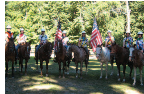
Another terrific Drill Team performance.