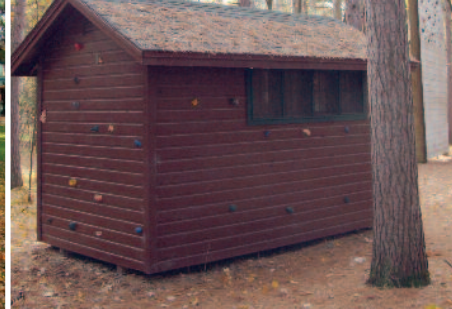
New bouldering system added to climbing wall shed.