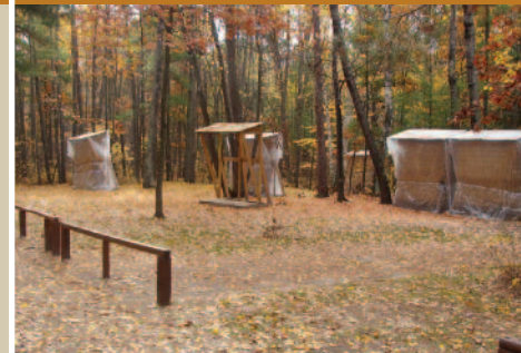
Additional New 10 yard target added for our beginning archers.