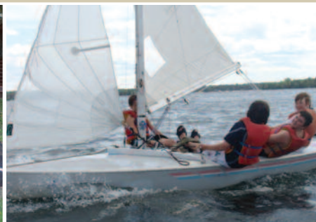
Think we can catch up?