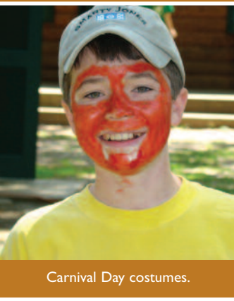
Carnival Day costumes.