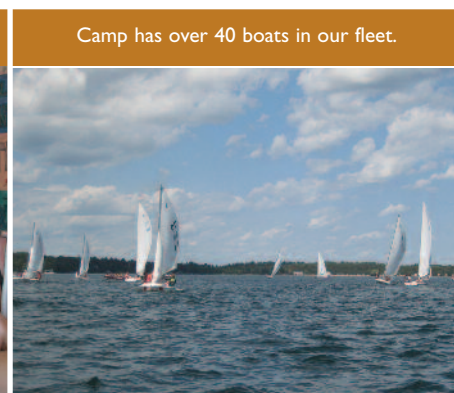
Camp has over 40 boats in our fleet.