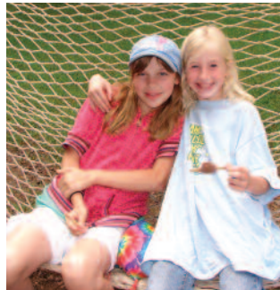
The hammocks are great!