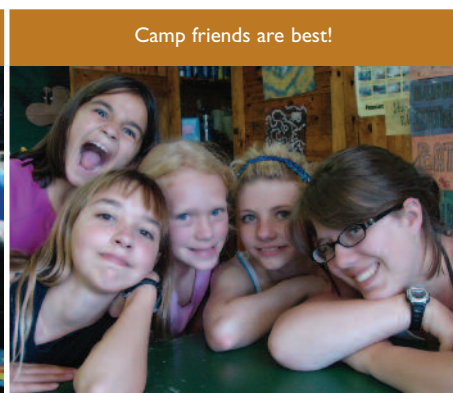
Camp friends are best!