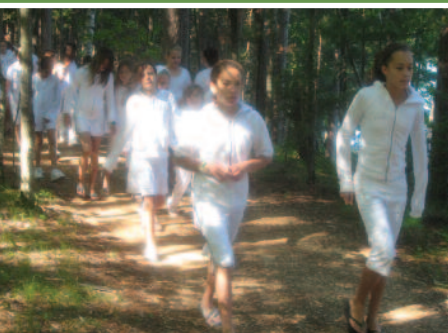
Going down the Chapel trail.

We all have much to be thankful for because our lives are abundant with friends, memories of our experiences and hope for the future to be even better. Our best wishes to each of you and all of your family as you celebrate this Holiday and a special "Thank you" from all of us for being part of our camp family. So, don't forget to say 'thank you' to everyone who makes a difference in your life.