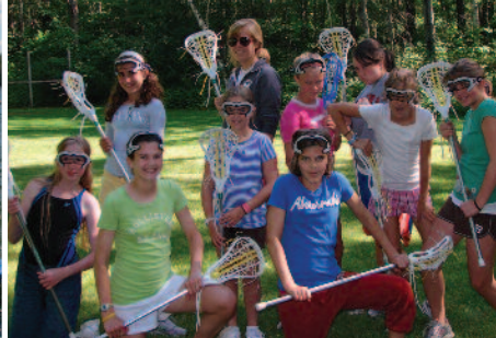
New equipment for Lacrosse.