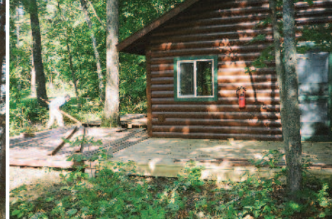
Deck expanded on new junior crafts building.