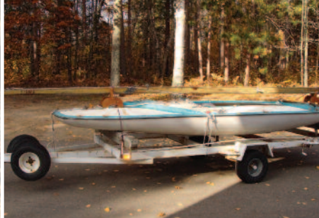
Donated M16 arrives at camp.