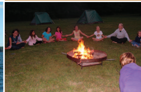
Over night camping on the big field.