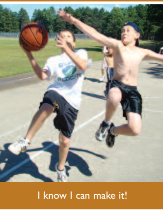
I know I can make it!