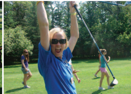
I like golf!