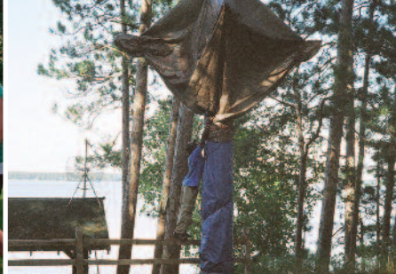
Both totem poles have been refinished and await unveiling next summer.