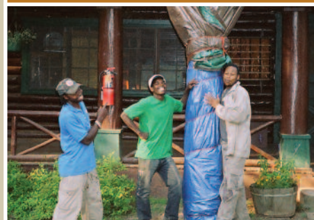
The totem pole was completely refinished... you won't believe how great it looks!