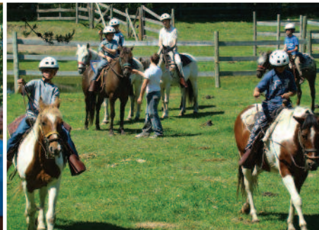
How many different horses did you ride?