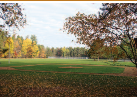
The athletic field and baseball diamond remain green all summer with new irrigation system.