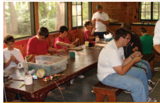
Lanyards, beading and friendship bracelets.