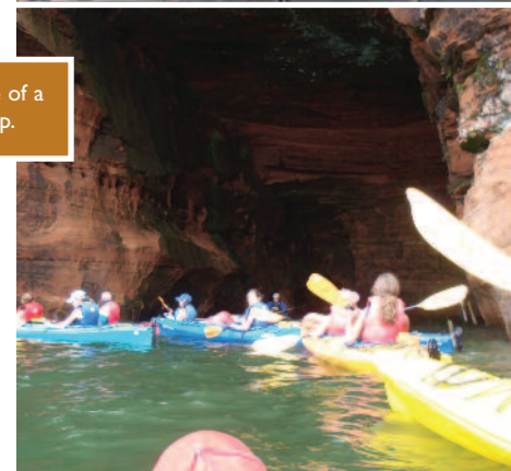
The adventure of a kayaking trip.