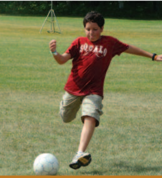
The goalie doesn't stand a chance!