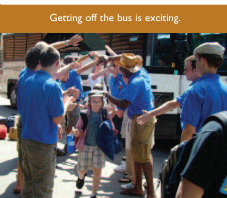
Getting off the bus is exciting.