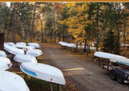
X boats and 420s ready to be checked this winter.