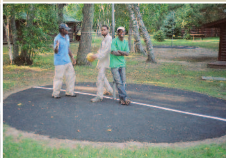
All the tetherball courts and basketball court in Prep Camp have been resurfaced.