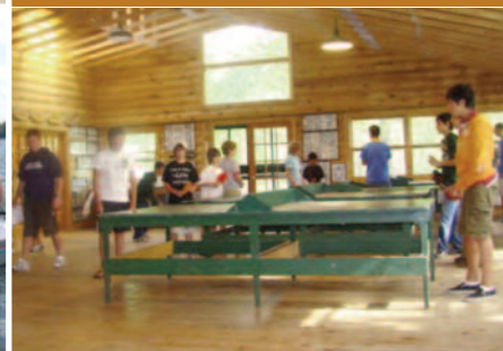
Another Table Tennis tournament.