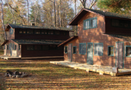
Bunkhouse and Pioneer have new front decks.