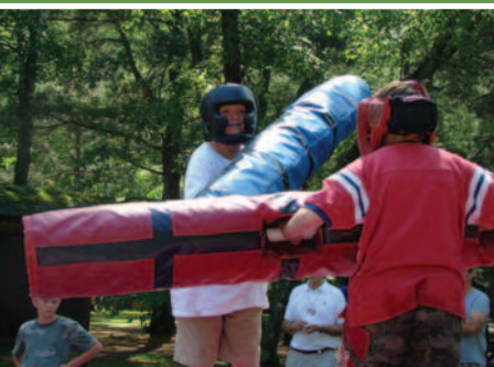
A special day challenge.