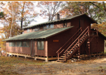
Orioles cabin remodeling has just started.