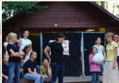
Our play productions are amazing.