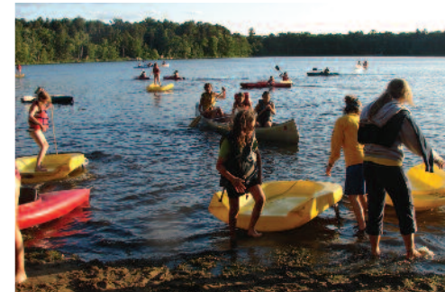
Fun bugs, gerbal balls, canoes, kayaks on Bass Lake.