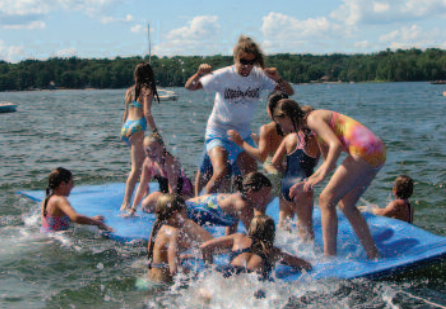
Our new water mat was fantastic.