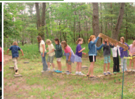
Teamwork at low ropes.