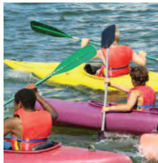
It's fun to learn how to kayak.