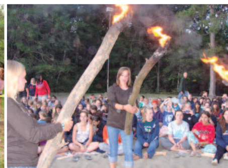
The LT's light another opening campfire.