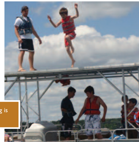
Loon jumping is fantastic!

Talk to your parents and enroll for 2009 now. We hope you'll join us for our 100th year!