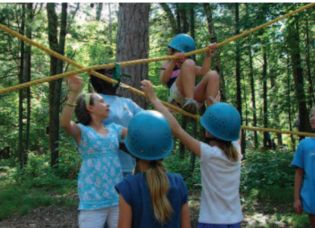
Cabin fun at the spider web.

CAMP LINCOLN FOR BOYS | CAMP LAKE HUBERT FOR GIRLS