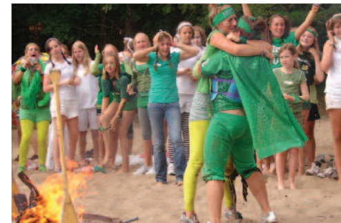
Color war fire building.