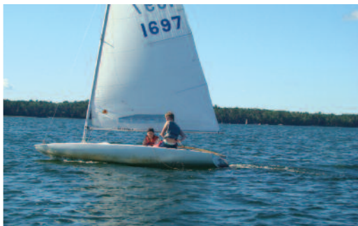
The MC is one of 5 different types of boats in our fleet.