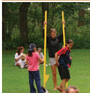
Silts, rope swings, hammocks & stacking cups are all fun extras at camp.