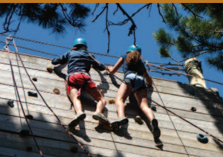
We made it 57 feet up!