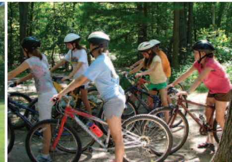
Mountain biking is a challenge.