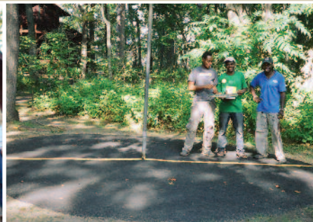
Tetherball courts have been resurfaced.