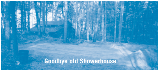
Goodbye old Showerhouse