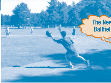
The New Ballfield!