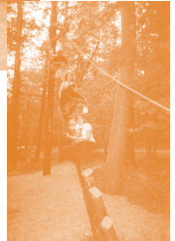
Fall work crew – finished project