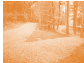
New woodchips for all the Ropes Courses

One of the projects they completed was putting up a pole to replace a tree that died for the incline log. Look at these pictures showing the process of putting the new log in and another shot sitting on their completed project.