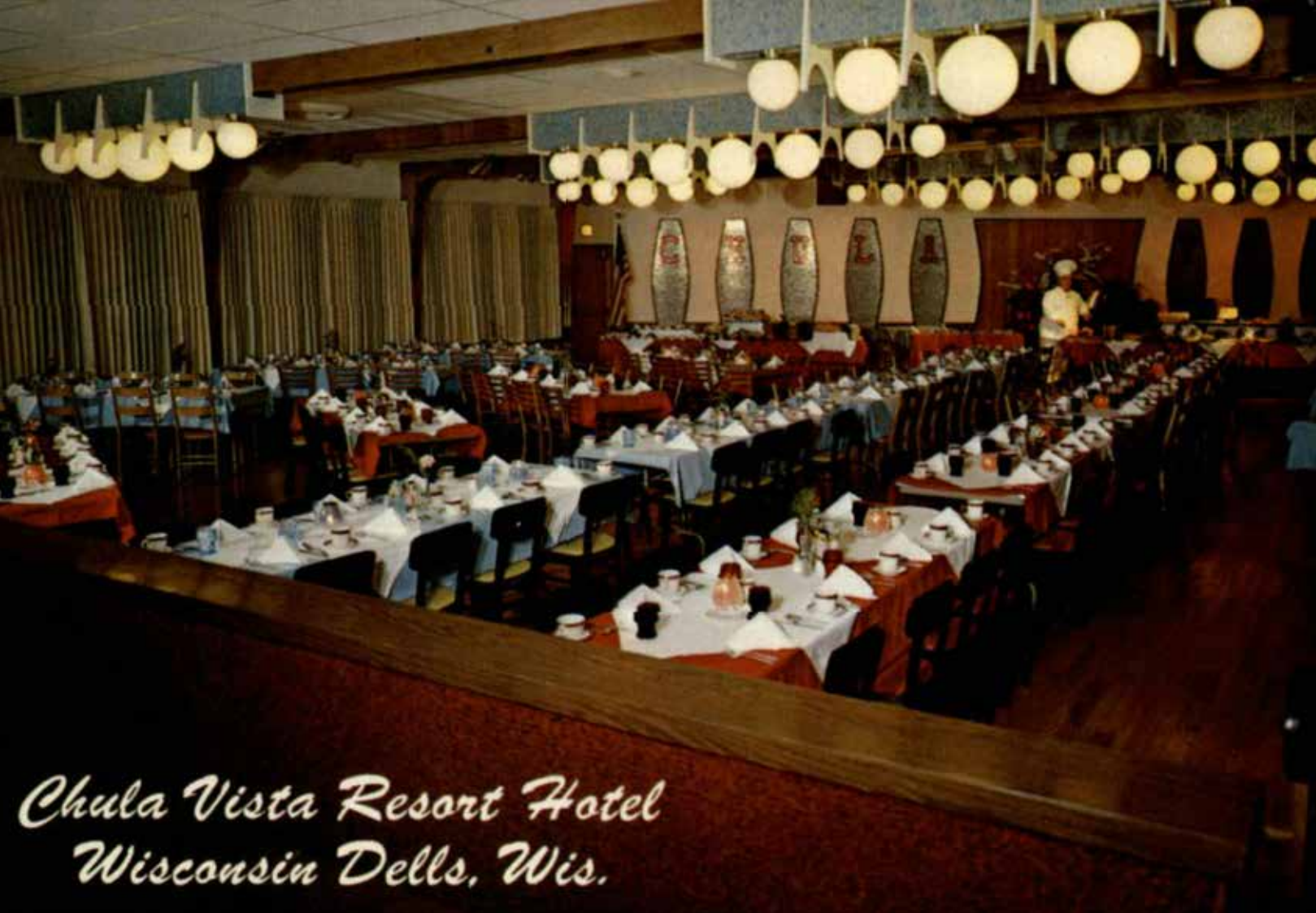
Chula Vista Resort Hotel Wisconsin Dells, Wis.