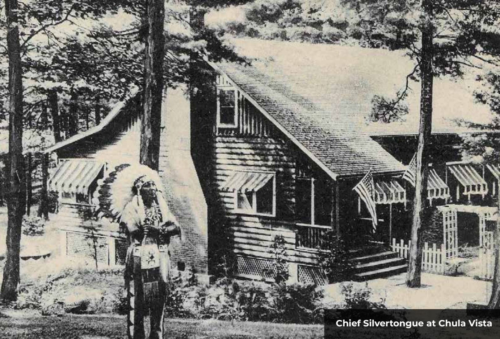
Chief Silvertongue at Chula Vista