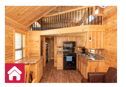
Hill Country Cabin