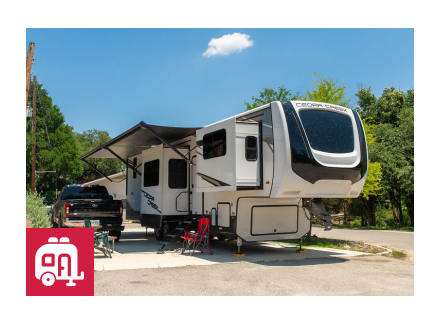
Red Carpet RV Site