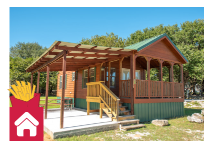
Yogi Bear™ Cabin