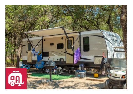
Premium RV Site