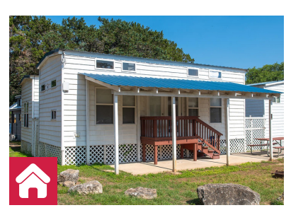
Cindy Bear™ Cabin