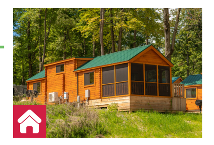
Three Rivers Bungalow Sleeps up to 8