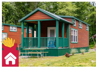
Cindy Bear™ Chalet