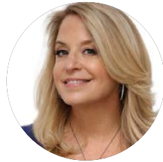
Dr. Laura Berman Therapist & Grieving Mama

The Healers and Teachers chosen for your retreat offer compassionate support and kindly donate their time and resources to support your healing journey.